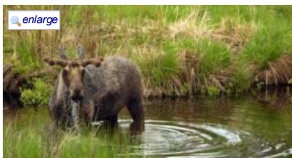
This is a moose from Isle Royale.

"This remarkable study offers us a unique insight into the